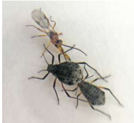
Figure 1. Pauesia nigrovaria female probing a GWA with its ovipositor.

In the following eighteen months we undertook host testing trials of Pauesia nigrovaria against five non-target aphid species, representing a range of aphid groups present in New Zealand. The cypress aphid