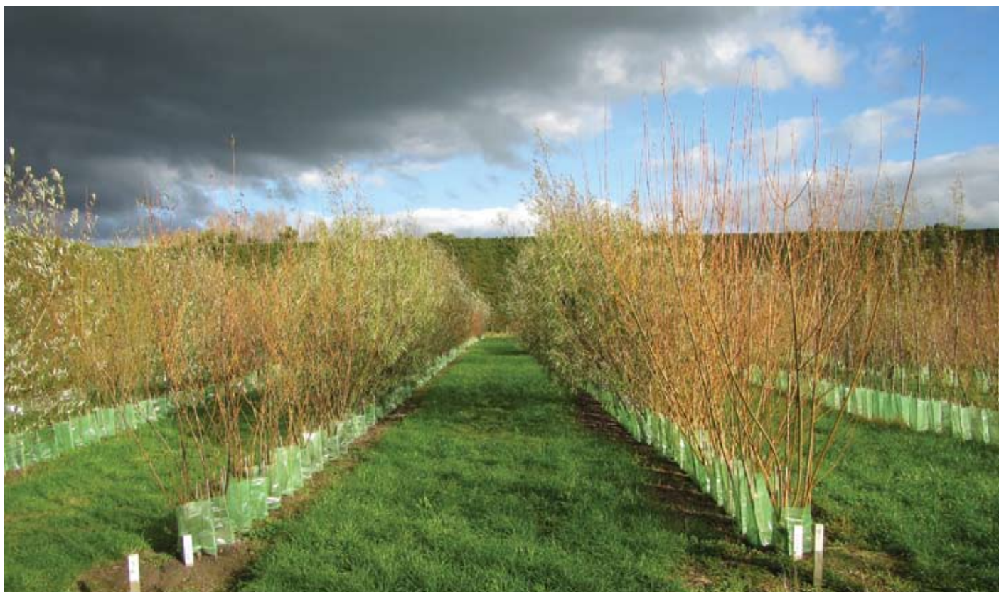
Figure 4. Salix viminalis trees with aphids (left row) and without aphids (right row) in June 2019.

The GWA-resistant S. lasiolepis x viminalis is a shrub willow that has recently been released to regional council nurseries. It is an early-flowering male clone, with potential for beekeepers, and has shown good drought tolerance and height growth.